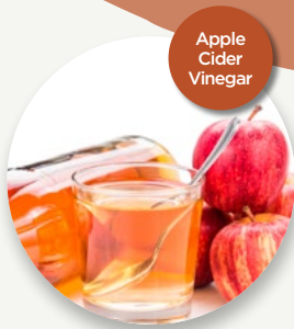
Apple Cider Vinegar