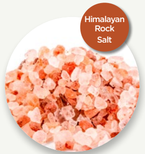
Himalayan Rock Salt